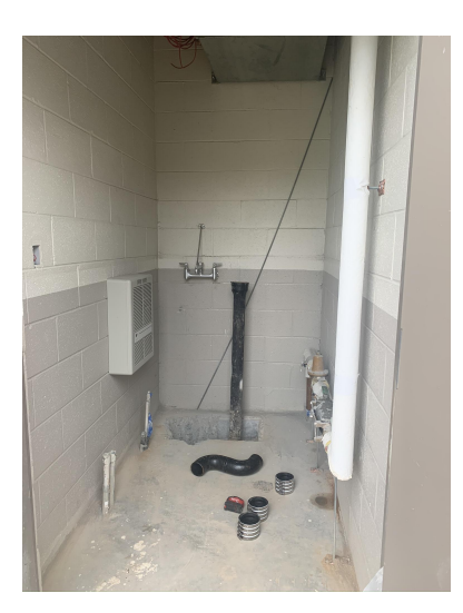
CSK- Mop Sink Installation