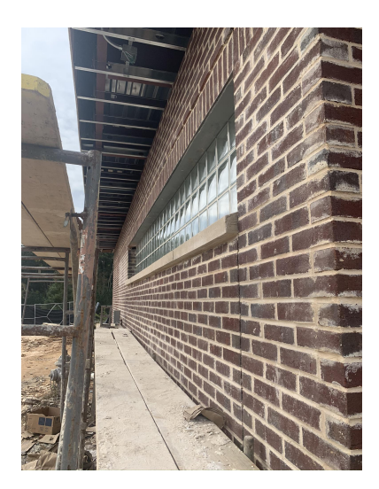
CSK- Glass Block Install